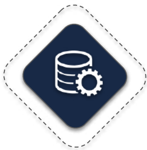
Master Data Management