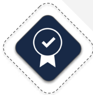
Data Quality Management